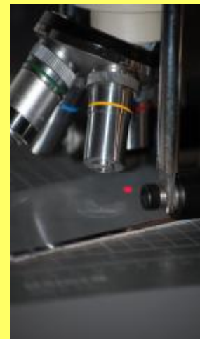
Multi precision optics on a turret mount