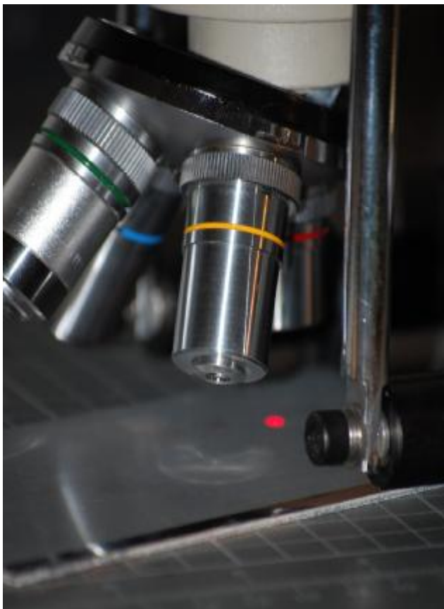
MF4x, MF10x ,MF25x, MF40x